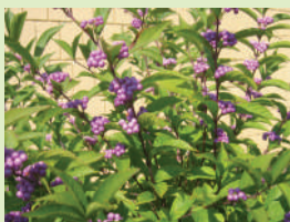
Large Shrub - Beautyberry