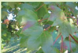
Large Tree - Red Maple