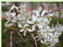
Small Tree - Serviceberry