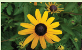
Perennial - Black-eyed Susan