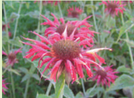
Perennial - Beebalm