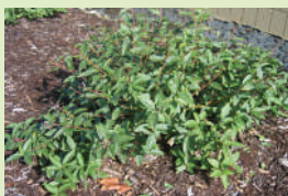
Small Shrub - New Jersey Tea